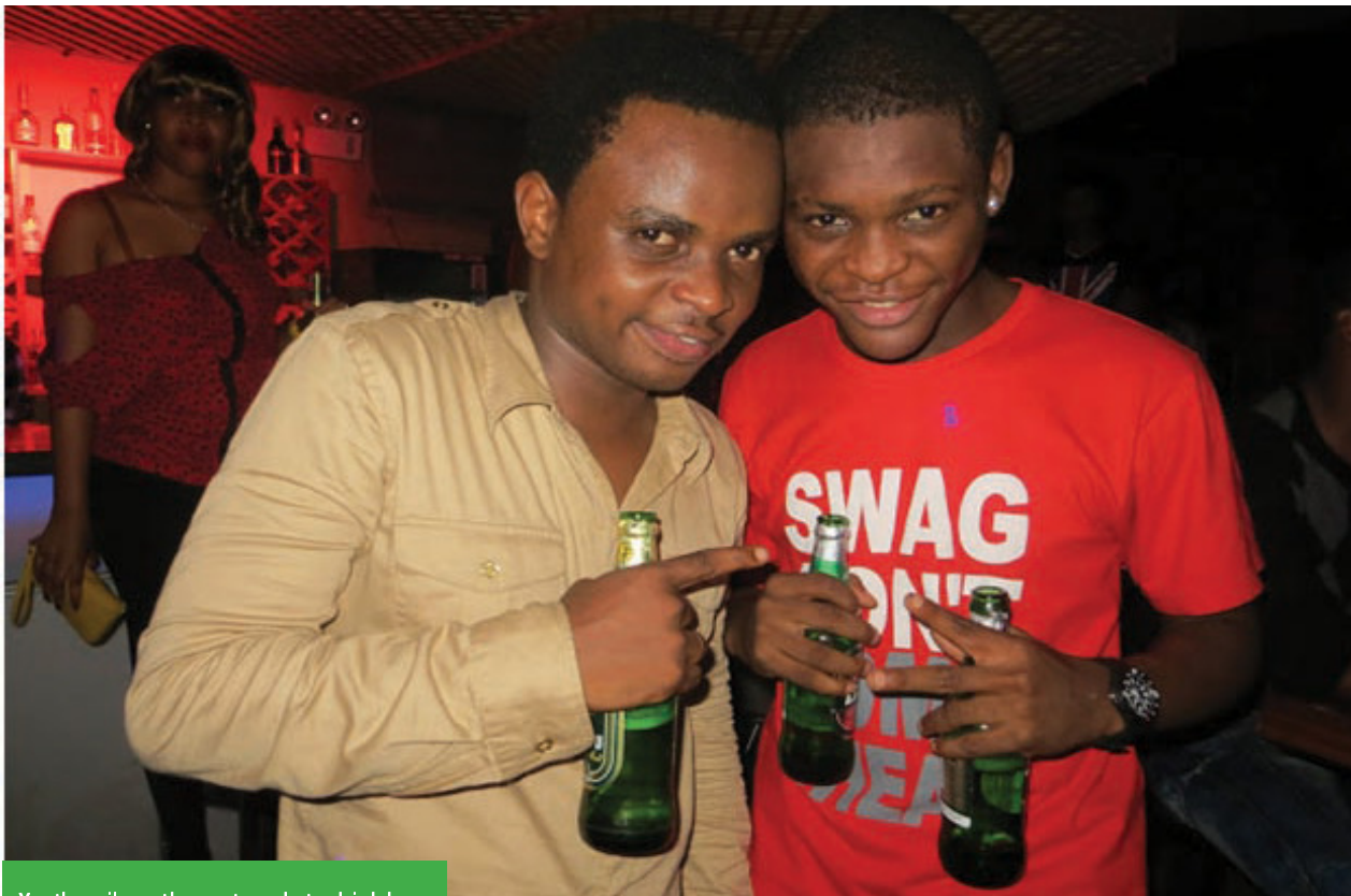
Youth smile as they get ready to drink beer