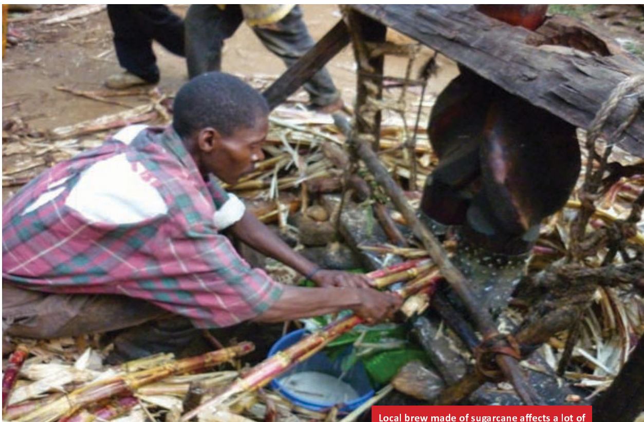
Local brew made of sugarcane affects a lot of people in rural areas.