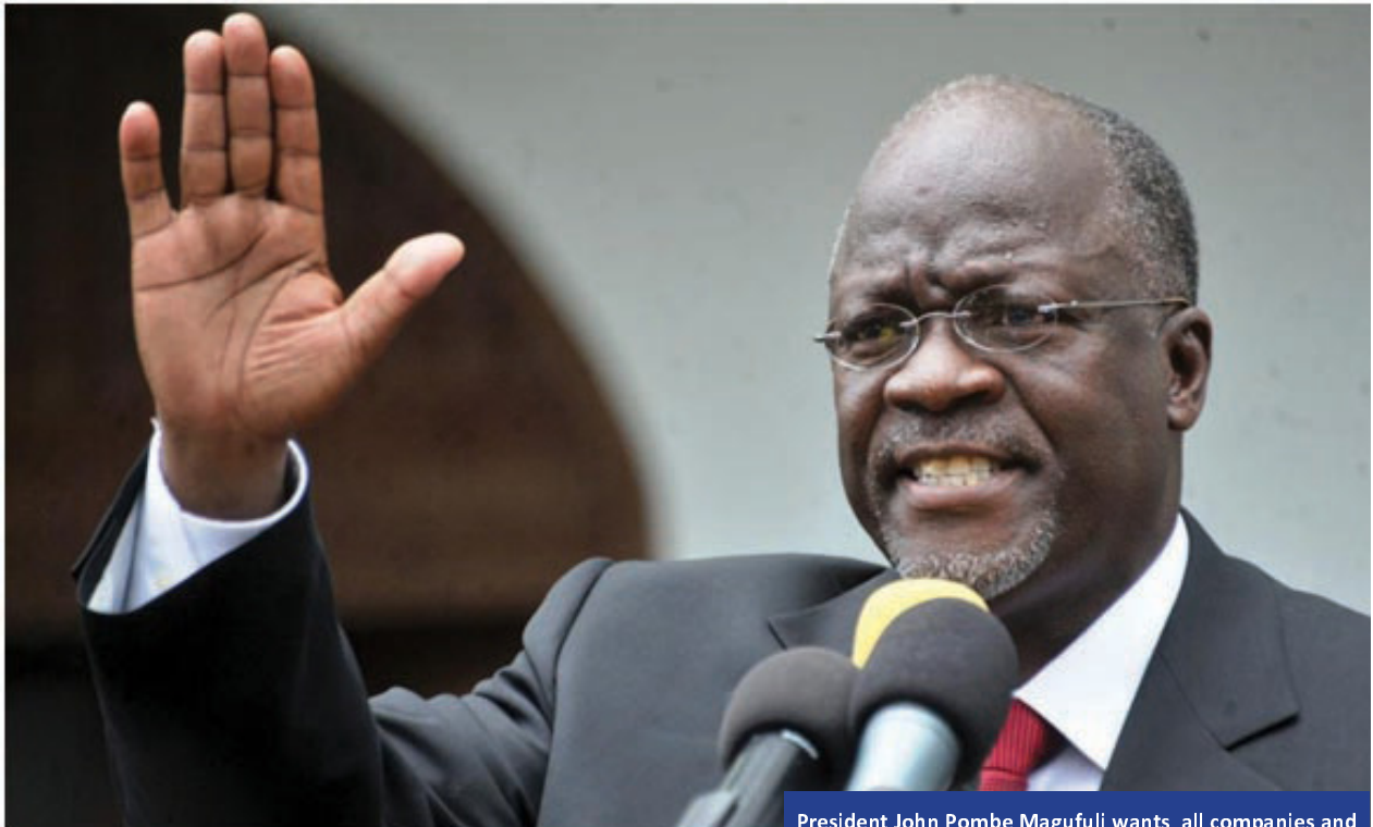
President John Pombe Magufuli wants all companies and individuals to pay their due taxes.