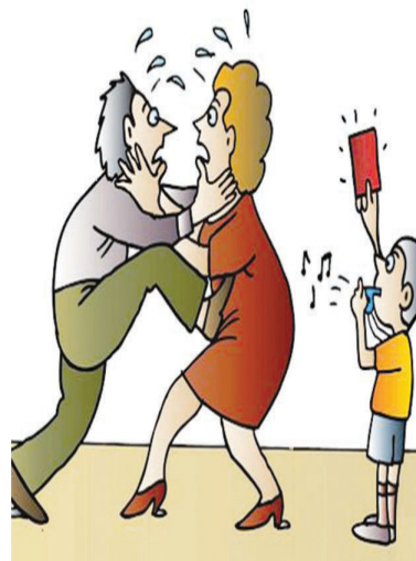
Alcohol: Source of family conflicts