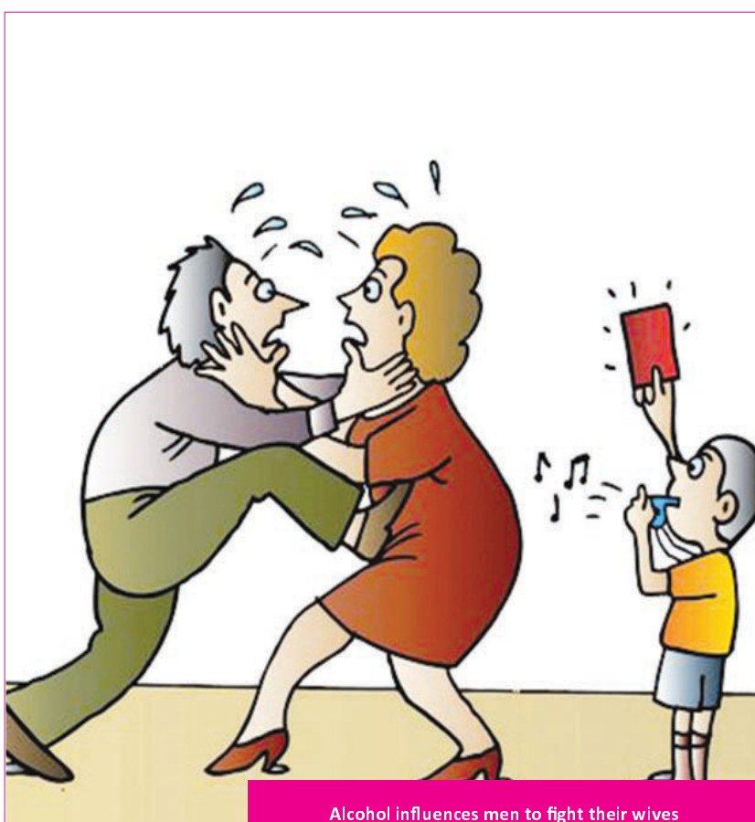
Alcohol influences men to fight their wives