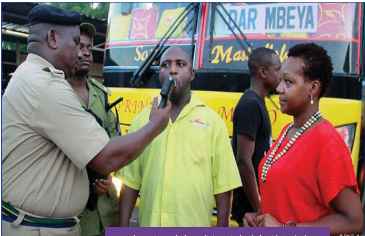
Police conducts a check up to find out whether the bus driver is drunk